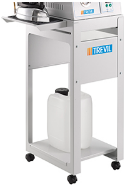
Refill tank included