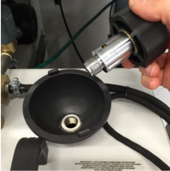
Built-in refill funnel