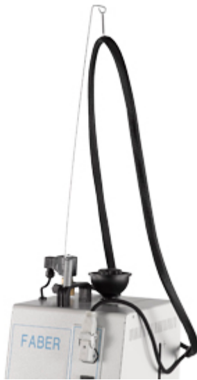
Cable holder rod